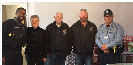
The Retired Workers Association from the AFL/CIO Construction and General Laborers' Local 1290 Union donated 20 tins of Velvet Crème Popcorn for the event.